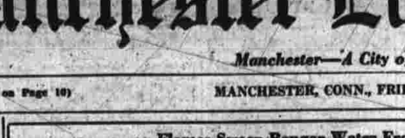
Flames Sweep Bangor Water Front

A large section of the Bangor, Me., water front on Front street is shown above engulfed by flames which early yesterday morning caused damage estimated at more than $1,000,000.